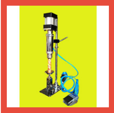
Aerosol Container Crimping Machine