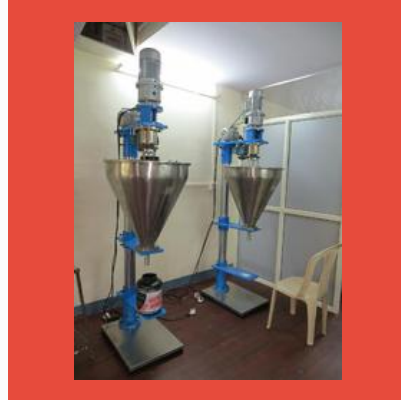
Powder Filler Machine