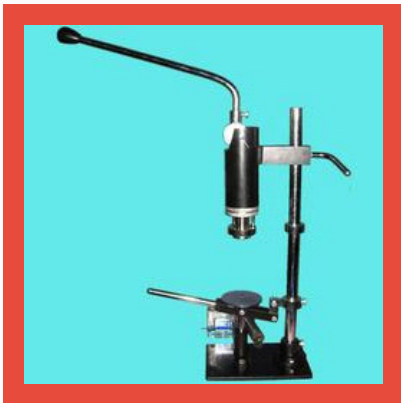
Glass Bottle Crimping Machine