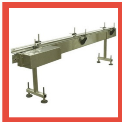
Table Top Conveyor