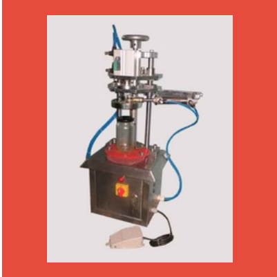
LUG Capping Machine