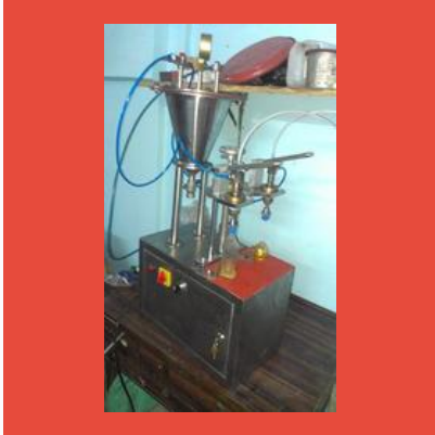
Vacuum Filling Machine