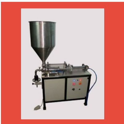
Toothpaste Filling Machine