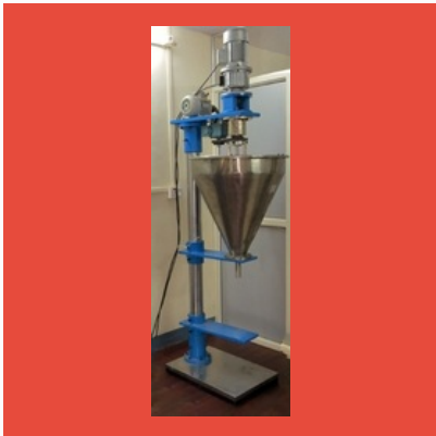
Powder Filling Machine