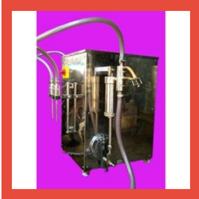
Volumetric Liquid Fillers