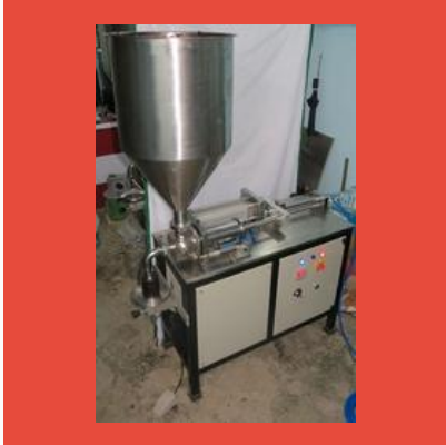
Jam Filling Machine