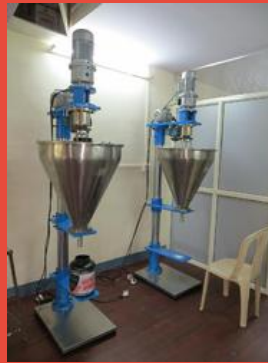
Talcum Powder Filling Machine