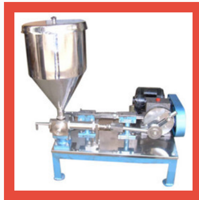
Paste Filling Machine