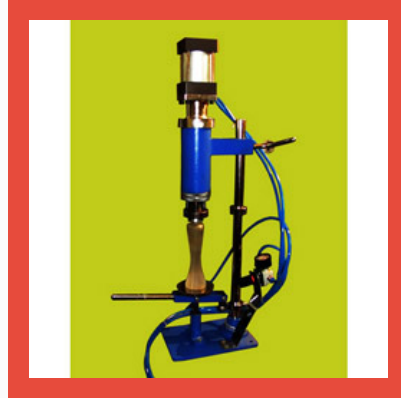
Perfume Bottle Crimpers (Pneumatic)