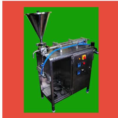
Gel Filling Machine