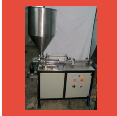
Semi Automatic Paste Filling Machine