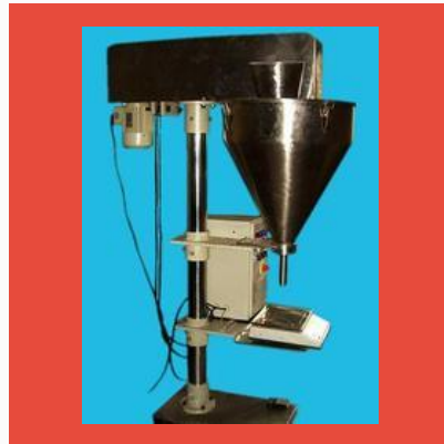
Toner Filling Machine