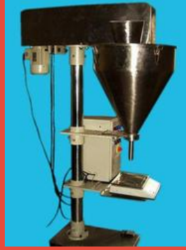
Powder Filling Machine