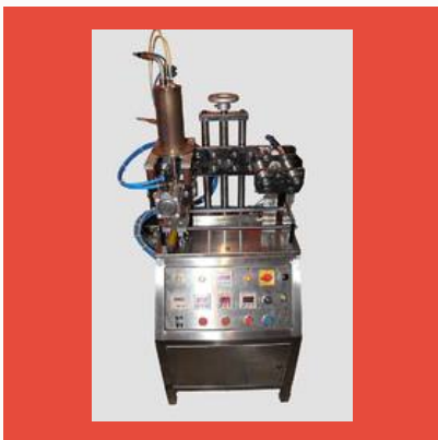
Semi-Automatic Tube Sealing Machines