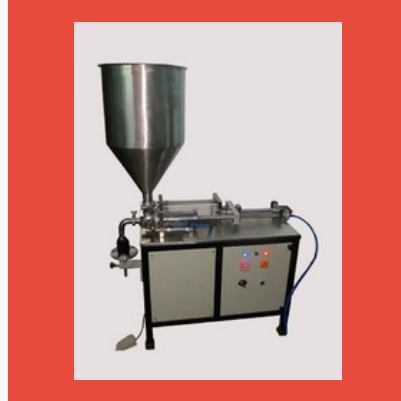
Paste Filling Machine