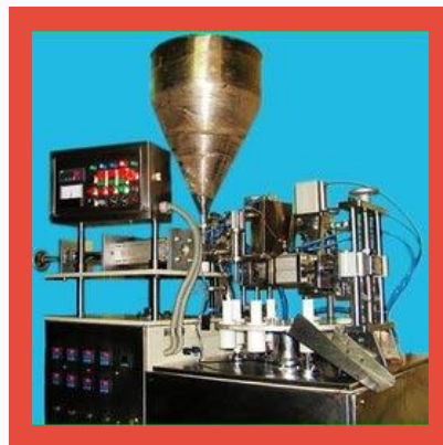
Tube Filling Sealing Machine