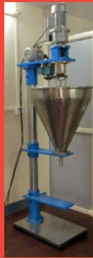
Powder Filling Machine