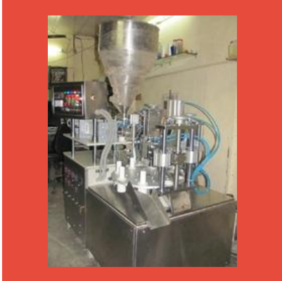
Tube Filling Sealing Machine