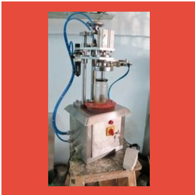
LUG Capping Machine