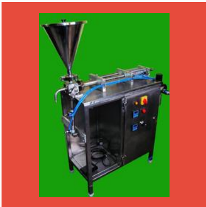
Cream Filling Machine