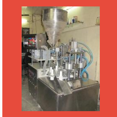
Tube Filling and Sealing Machines