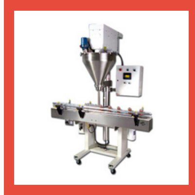
Automatic Powder Filling Machines